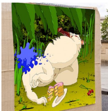
Greta and the Crocodile