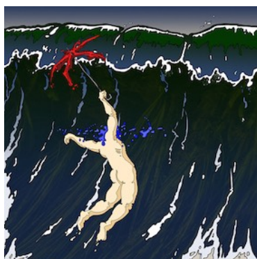
Under The Wave